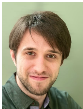
Thomas High Academic Support